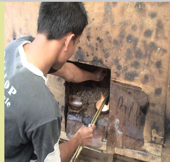
Dealer melts gold with a blow torch