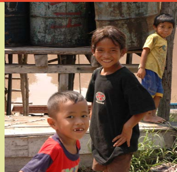
Children must not play around gold shop

People living near gold shops can be seriously poisoned with mercury